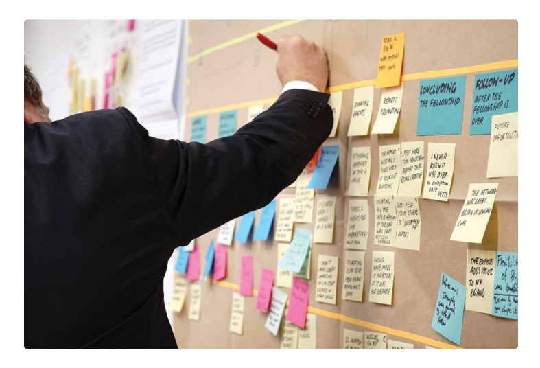
Stephen R. Covey Author, The 7 Habits of Highly Effective People

Kirkpatrick's four levels is the best I've ever seen in evaluating training effectiveness. It is sequentially integrated and comprehensive. It goes far beyond 'smile sheets' into actual learning, behavior changes and actual results, including long-term evaluation. An outstanding model!