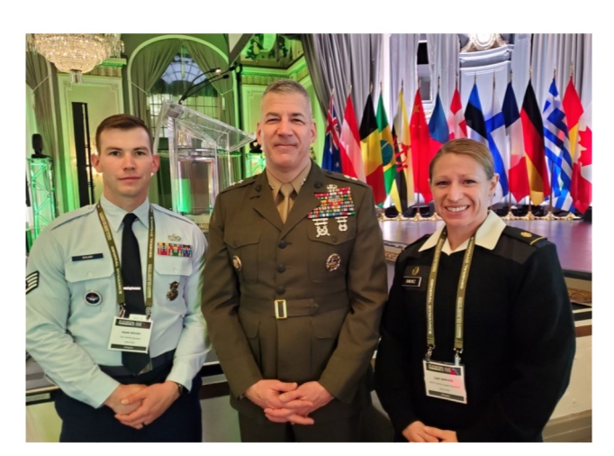
Quebec, Canada - 12 February 2020